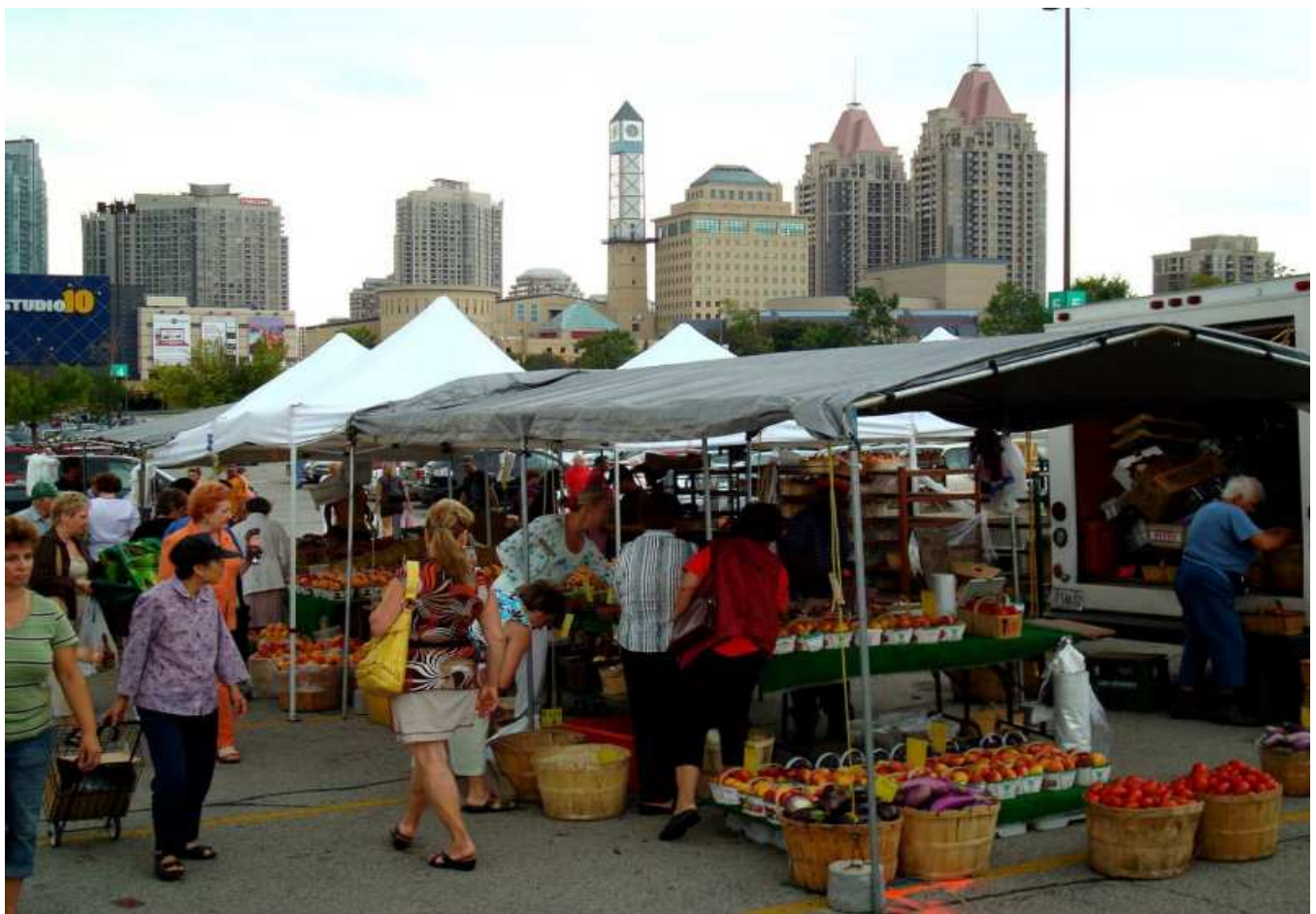
Figure 1-1: Formed in 1974, Mississauga is recognized as Canada's sixth largest city and Ontario's third largest city, with a population of over 730,000 residents representing cultures from around the world. Mississauga has many attractions and events that run at various times throughout the year. The Downtown is a central spot for activities, including the Farmers' Market.

Mississauga Official Plan provides a new policy framework to protect, enhance, restore and expand the Natural Areas System to direct growth to where it will benefit the urban form, support a strong public transportation system, protect, enhance, restore and expand the Natural Areas System and address the long term sustainability of the city. Mississauga Official Plan will be an important instrument in city building. All change within the urban environment will be considered for its capacity to create successful places where people, businesses and the natural environment will collectively thrive.